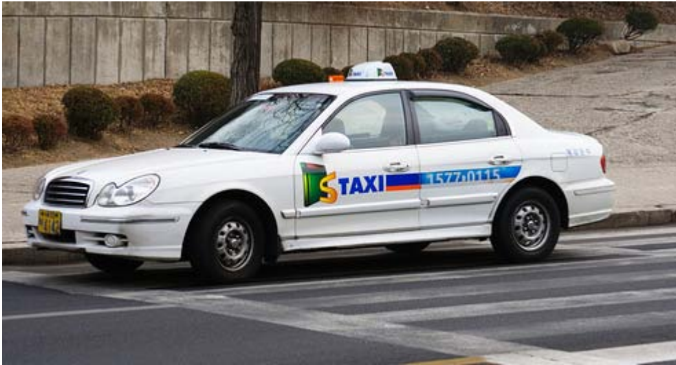
(The appearance of a regular taxi.)